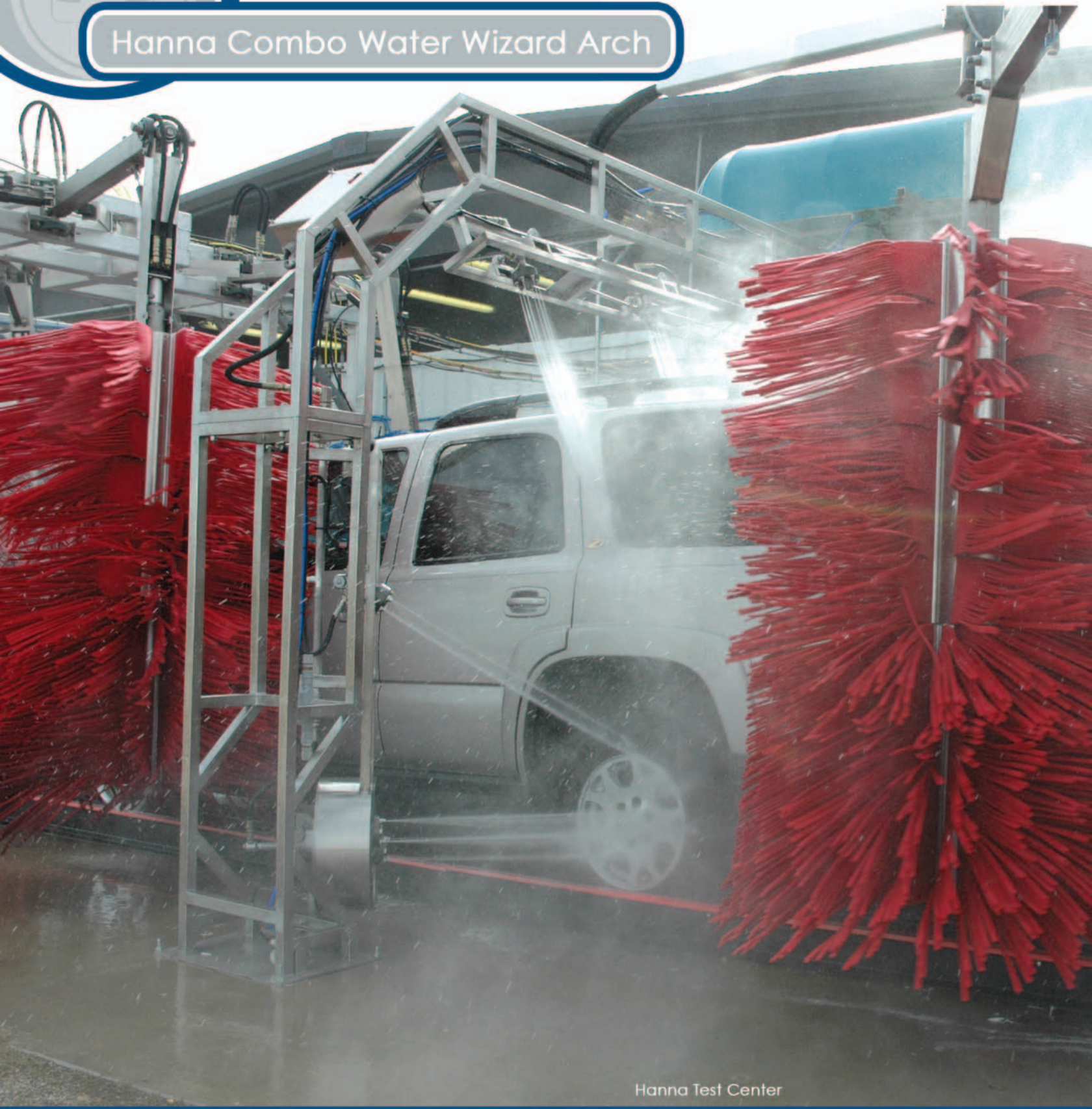
Hanna Test Center