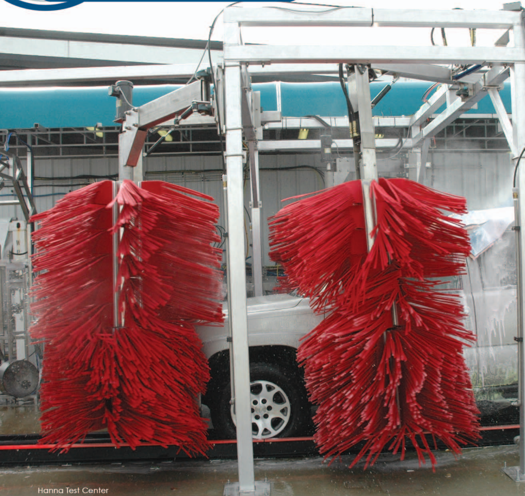
Hanna Test Center