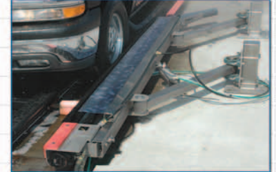
Hanna Tire Glaze Applicator

Evenly coats tire dressing from edge of wheel to tire tread. Eliminates spotty application.