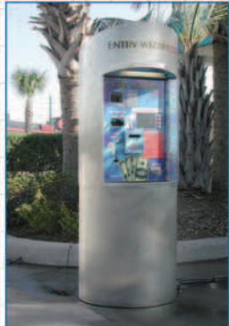
Entry Wizard Point-of-Sale

Trusted POS Technology - Now with Integrated Gate System!