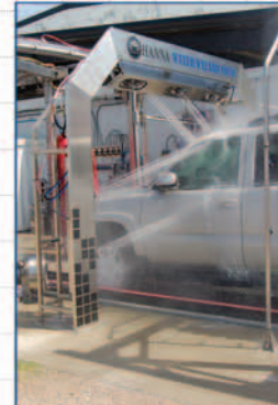
Water Wizard Arch

Maximum coverage of all top horizontal and vertical surfaces.