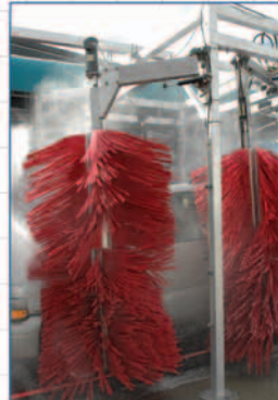
Hanna 4-Pack Flex Wrap

4 counter-rotating 70" brushes All in 13 feet of operating space.